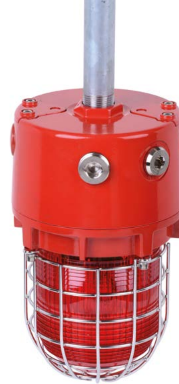
D1x B2 beacons - pendant mounting