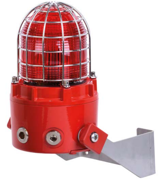
D1x B2 beacons - bracket mounting allows beacon to be rotated in any orientation