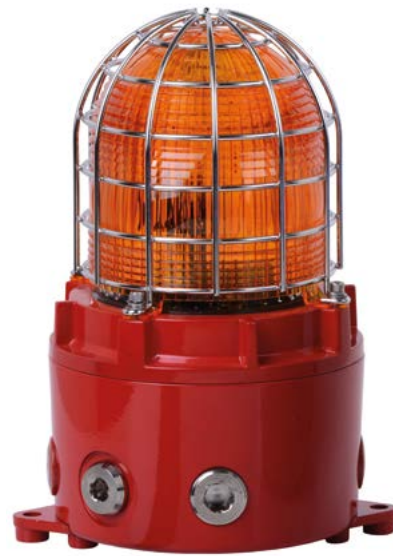
D1x B2 beacons- surface mounting