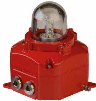
D2xB1XH1 / D2xB1XH2