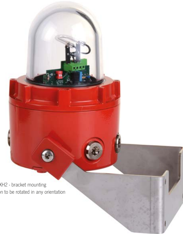
D1xB2XH1/XH2 - bracket mounting allows beacon to be rotated in any orientation