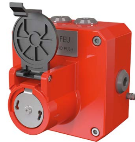
GNECP7-PT / GNECP7-PM